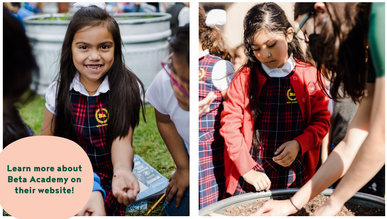
Beta Academy, Texas

And we can't wait to see where they go next!